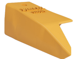
ADCO® 100 LH Tooth