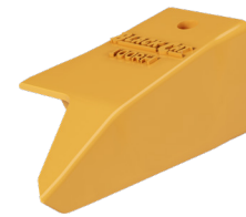
ADCO® 100 RH Tooth