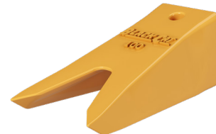
ADCO® 100 Center Tooth