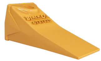
Bobcat® Tooth 6737325