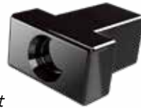
Rubber Bolt Seat