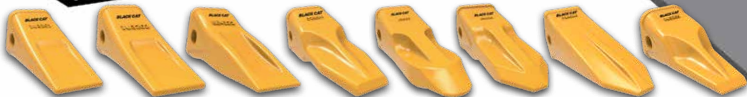
Standard Short Standard Long HD Long Penetration Plus Extra RS Rock Chisel Penetration J Series Teeth