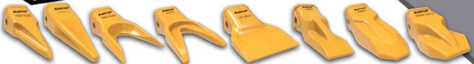
Tiger VX Penetration Twin Tiger Twin T Narrow Flare Tooth L Profile HD Penetration HD Abrasion