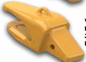
Weld On Heavy Duty 2 Strap Loader Adapter