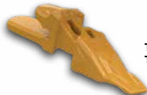
Top Pin Tooth & Adapter