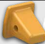
Weld On Adapter Nose