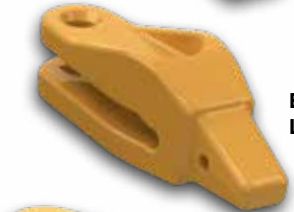
Bolt on Loader Adapter