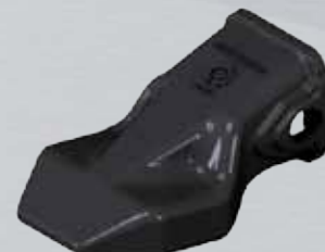
Heavy Duty Abrasion