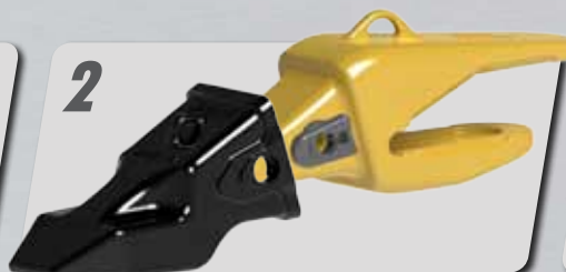
2 Fit Tooth over Nose & Convertor