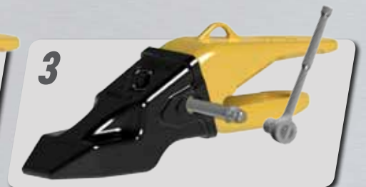
3 Insert Helical Pin & Rotate 180 degrees with Socket Wrench to Engage Lock