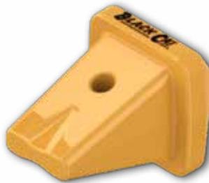
Weld On Nose